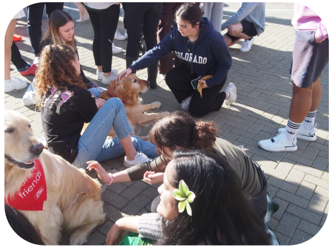
Oakie & Thumpa