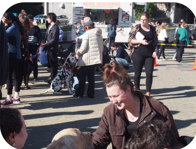
Arlo & Thumpa