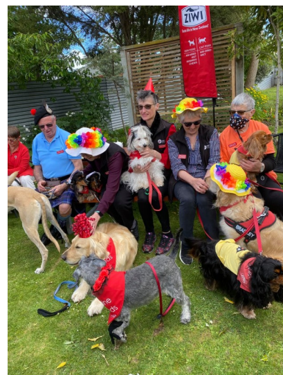
More party hats in groups