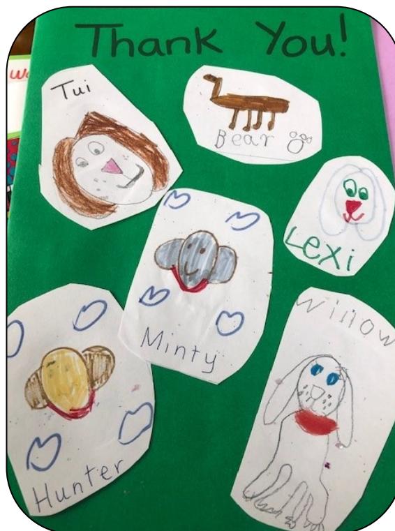
Special thank you cards from the children