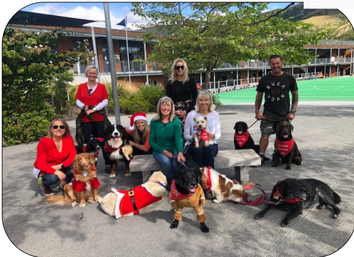
Dog day Christmas Party at Remarkables Primary

– this is some of our Reading In School team – the Staff put on a lovely morning tea with the dogs invited of course being given specially baked dog heart shaped cookies.