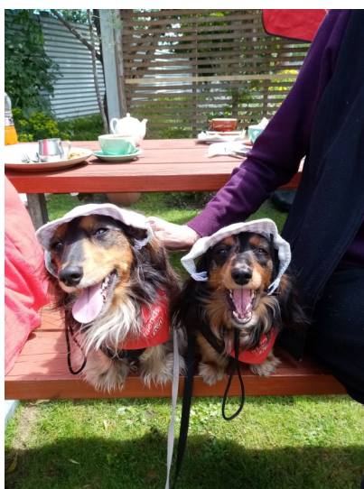
Zara & Mocha