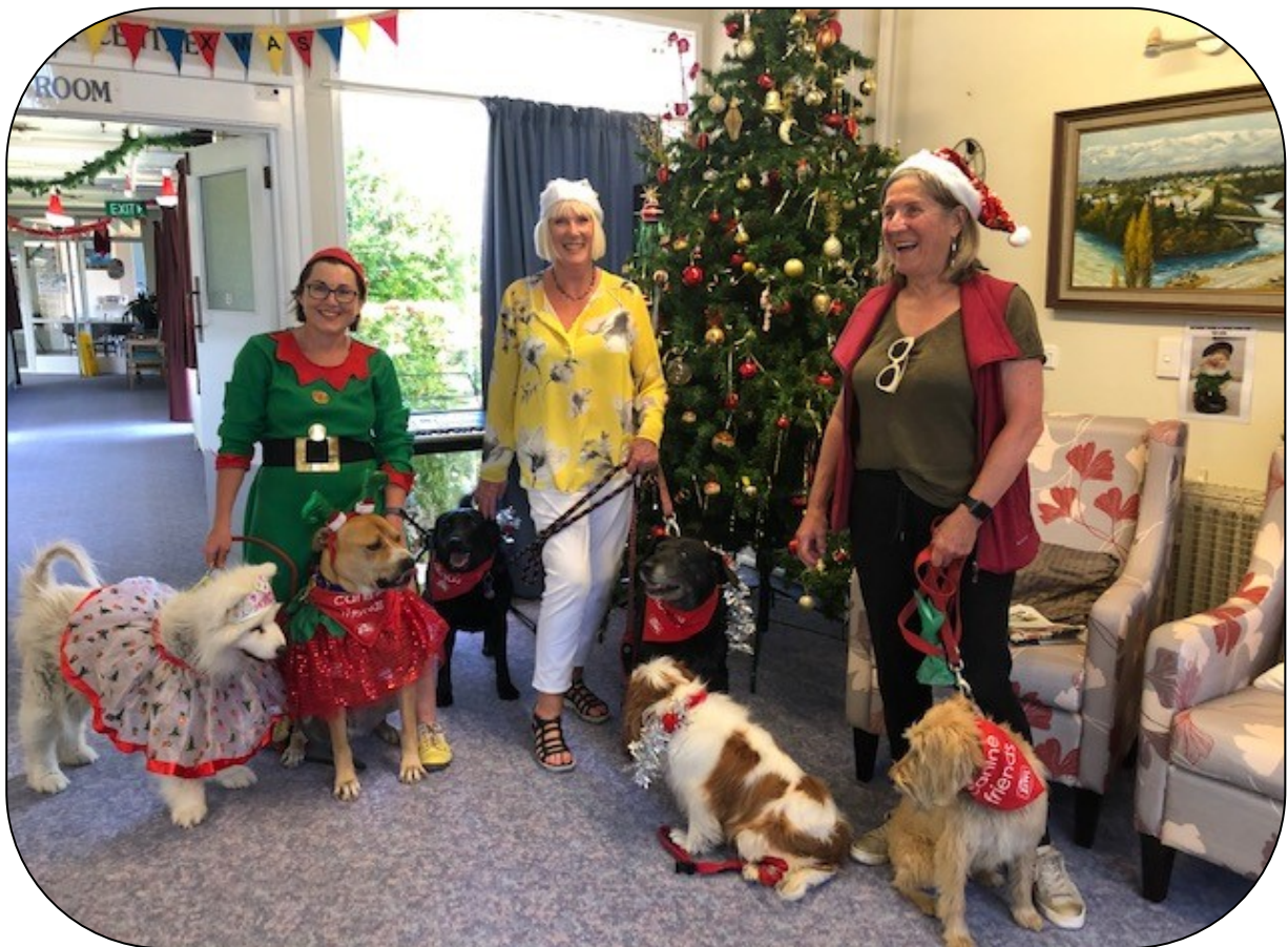
A very happy and cheerful Christmas visit to the Ripponburn Hospital and Home in Queenstown in 2020