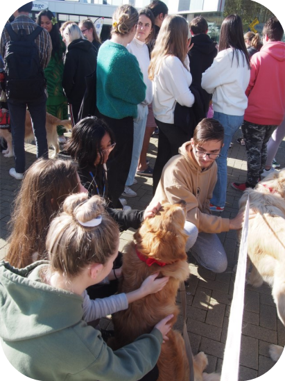
Oakie & Thumpa