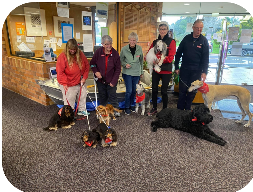
Happy Group photo