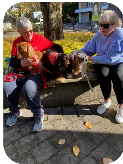
Our dear little Cavaliers