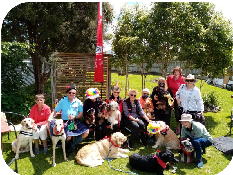
Thumpa & Bingo