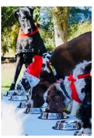
Where is mine?