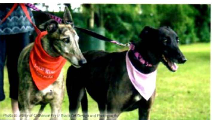
Brat is a Beaut