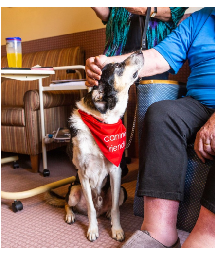
Willy loves pats