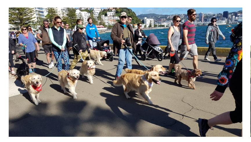
Dogs' Day Out in Wellington continued