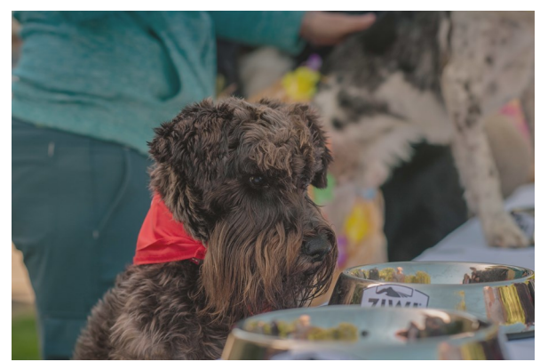
Mmm..... Can I start!

Of course, we couldn't agree more and our Organisation is looking forward to the Partnership and our members purchasing the premium food that is available.