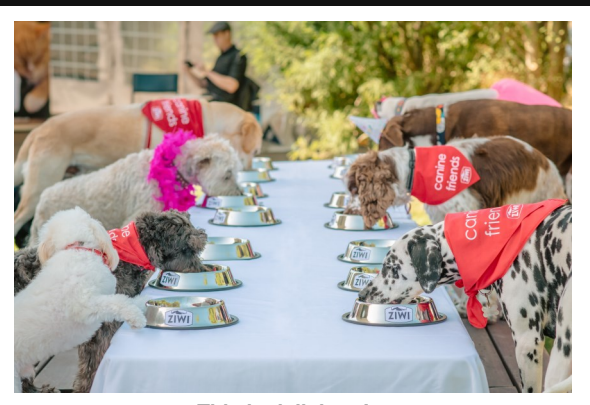
This is delicious!

"Mt. Maunganui based premium Pet food manufacturer, Ziwi, opened a new facility in Christchurch and to celebrate invited some local "dog friends" for a Dog's Morning Tea. Everyone from Great Danes to Chihuahuas sampled some of the first products off the line.