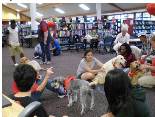
A very happy group of stress free students