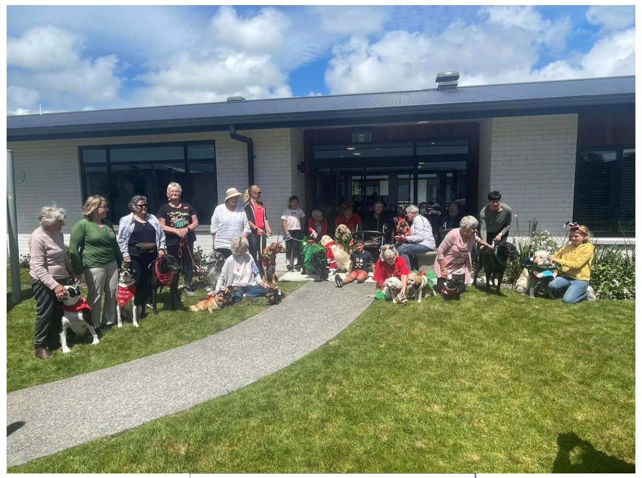
Some of our members in Christmas dressup

The dogs then all had a puppachino for their efforts before producing an amazing Christmas dog dress-up competition which was judged by 3 of the delighted residents so everyone had to parade in front of them with some gaining an extra vote with a pat and cuddle included as they past by. There were dogs in striped pj's, elf costumes, santa costumes, dresses, Santa ears, lots of tinsel and jingle, quite a festive sight to all. Lunch was a shared banquet which was followed by all dogs receiving a Christmas parcel which they came and picked for themselves.